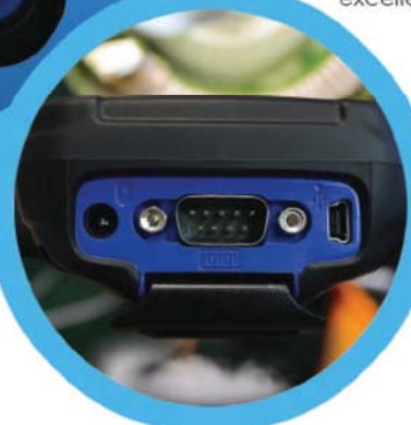
Wi-Fi, Bluetooth, GPRS modem, 5 MP camera, voice call and MMS mini waterproof USB connector, RS232 serial port

STONEX S4 II supports RTCM 2.3 differential correction signals from CORS and GPS networks: in addition to the worldwide correction signals WAAS, EGNOS, GAGAN, MSAS, QZSS the positioning accuracy can be increased up to 1 m.